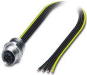
Sensor/actuator flush-type plug, 4-pos., front/screw mounting with M16 thread, with 0.5 m PP litz wire, 4 x 1.5 mm 2

Please be informed that the data shown in this PDF Document is generated from our Online Catalog. Please find the complete data in the user's documentation. Our General Terms of Use for Downloads are valid ( http://download.phoenixcontact.com )