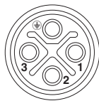
Connector pin assignment of M12 socket, 4-pos., S-coded, view of socket side